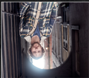
IMITATING THE DOG

Clever storytellers. Using a mixture of live performance and technology they make beautiful images in the space between important ideas. Their work has built a company with a unique reputation in the UK, Europe and internationally.